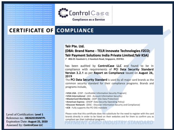
telr Latest PCI Certificate

libraries and APIs, eBC too is automatically compliant with the highest PCI requirements.